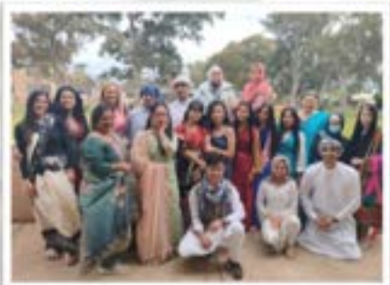
CULTURAL DRESS DAY