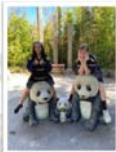
ADELAIDE ZOO EXCURSION