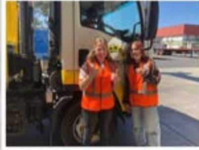
STEM GIRLS CONFERENCE