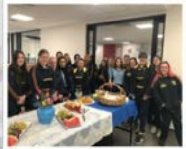
NASSA MATHS OLYMPICS