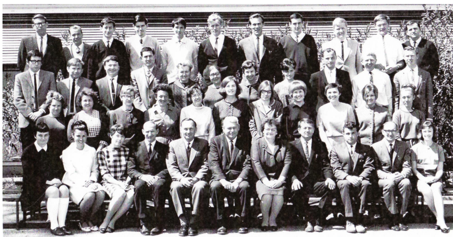
A staff photo from 1965 or 1966