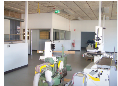
View of the woodwork workshop and the new project store

In addition to the above the Salisbury High School was able to complete/plan projects through other government grants: