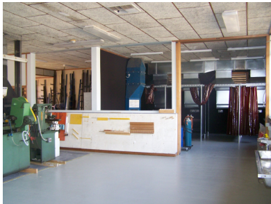
View of the metal workshop with its improved welding bays and improved

Here are some pics of the Tech Studies upgrade - this project should be finished in just a few weeks: