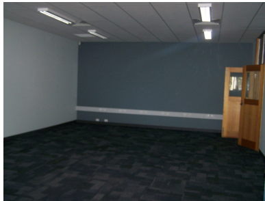
View of the new Design Classroom (converted project store)